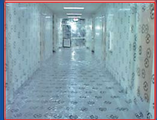
The BearAcade™ Way