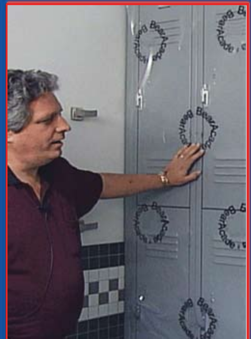
BearAcade™ on Lockers