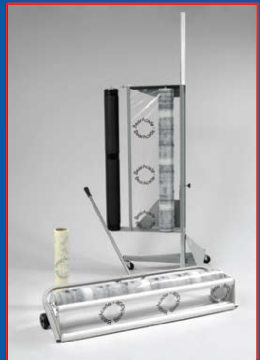
Floor and Wall Applicators