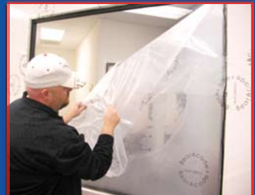
Easy to Remove