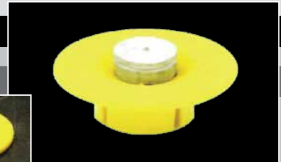
(E-Z) Link Button