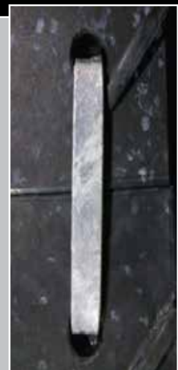
Single Flat Link