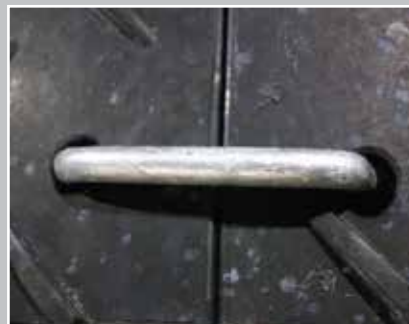
Single Round Link