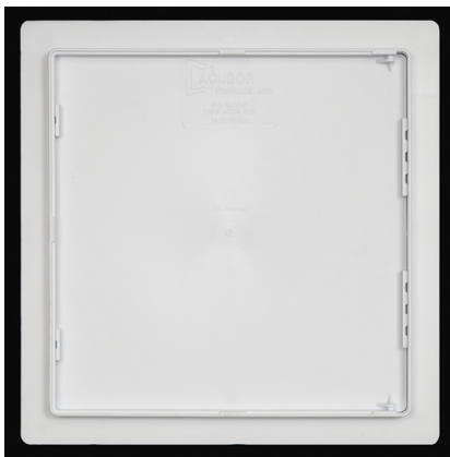
PA-3000 View of door back

For more information on Acudor Products Inc. visit www.acudor.com or call 800.722.0501